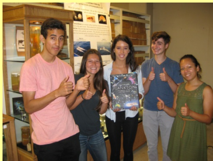
Tour of the Pelagic Invertebrate Collection - Plankton Rules!