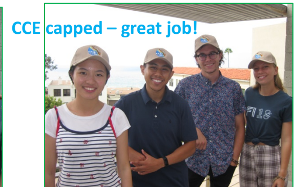
CCE capped – great job!